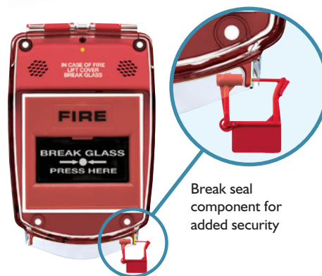
Break seal component for added security

Fully rotational hinge provides increased protection against vandalism